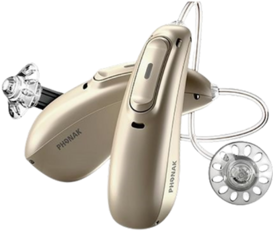
Receiver-in-Canal (RIC) Smart & Rechargeable