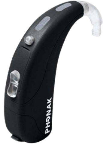
Behind-the-Ear (BTE) Powerful & Durable