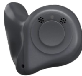
In-the-Ear (ITE) Comfortable & Natural